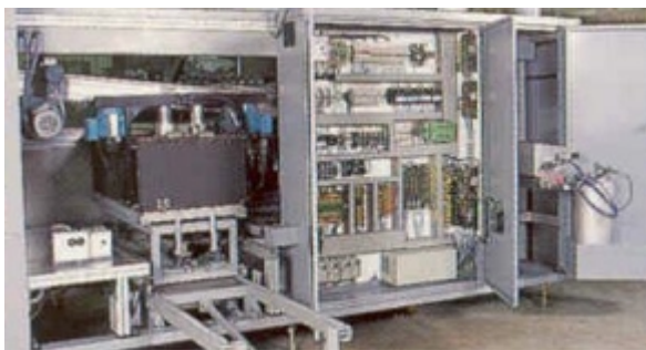
Full access front and rear.

6 foot preheat capability Slide-out preheaters Infrared or forced convection Heater tunnel with tempered glass covers